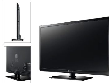
Stylish and slim design ideal for professional security environments