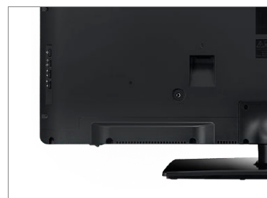
Built-in speakers enable more rigorous security monitoring