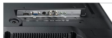
Video versatility, including VGA, HDMI, S-Video and BNC In/Out