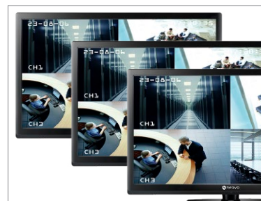
Looping BNC video inputs allow multiple display connections