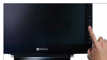
Durable metal casing for enhanced strength and secure mounting