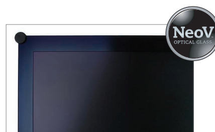
NeoV™ Optical Glass protects against scratches, impacts and other physical damage