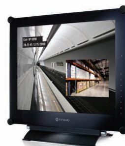
Smart Omni Viewer provides flexible image viewing options such as PIP/PAP, freeze, 180° image rotate