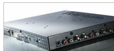
Ultimate video versatility, including passive looping BNC video for multiple display connections