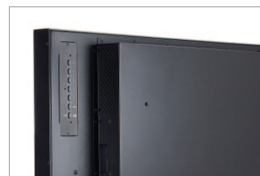
Durable metal casing for enhanced strength and secure mounting