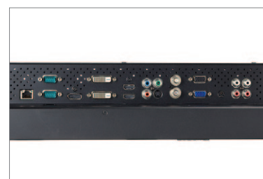
Multiple video inputs (VGA, DVI, HDMI, BNC, S-Video, DisplayPort and Component) allow for effortless system integration