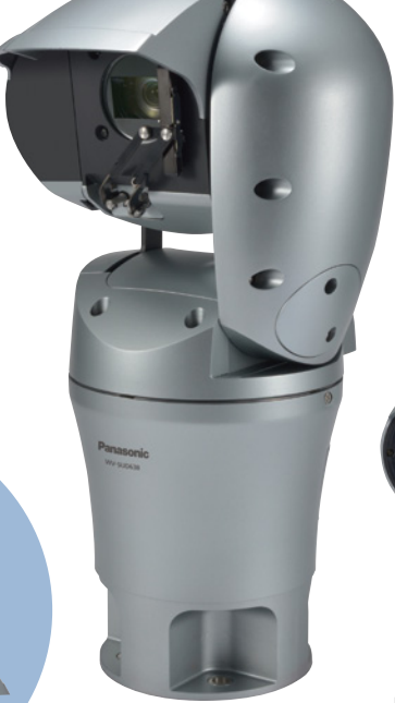
WV-SUD638 (Natural Silver) WV-SUD638-H (Gray) WV-SUD638-T (Brown)