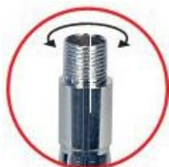
Tubes Ø 10/12/14